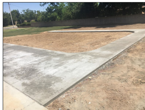
Playground area progress

Please continue to keep this new ministry in your prayers, that God would bless our discussions and plans, and continue to open doors for us. Offerings toward this in 2019 should have checks made out to "St. Peter Lutheran ECM" and be clearly marked.